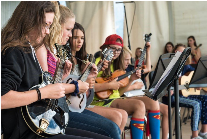
(Left) Young musicians perform at the Queen Bee Kids Bluegrass Camp in Santa Fe, New Mexico, funded by a 2021 Foundation project grant.

Endowments: The IBMA Foundation endowment at the Community Foundation of Middle Tennessee is now worth $57,763 . Our Vanguard investment fund is at $77,746 . The agency endowment that funds the Sally Ann Forrester Scholarship totals $21,670 . The IBMA Education agency endowment which funds the IBMA Bluegrass College Scholarship totals $17,695 . We set aside $30,000 —roughly half of what was donated during the 20-21 fiscal year to the new initiative—to create an agency endowment fund to support Arnold Shultz Fund grants in the future.