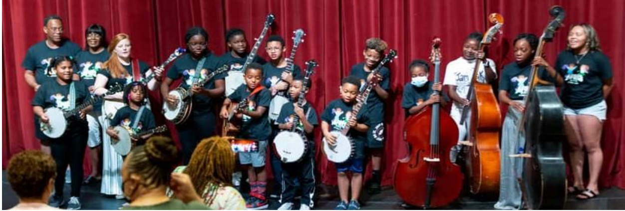
New banjo and bass players in the Ban Jam class perform for a Juneteenth celebration in Chandler, Arizona. The program was funded in part by a 2021 Arnold Shultz Fund grant.